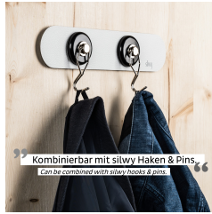
Kombinierbar mit silvny Haken & Pins

Can be combined with silvny hooks & pins